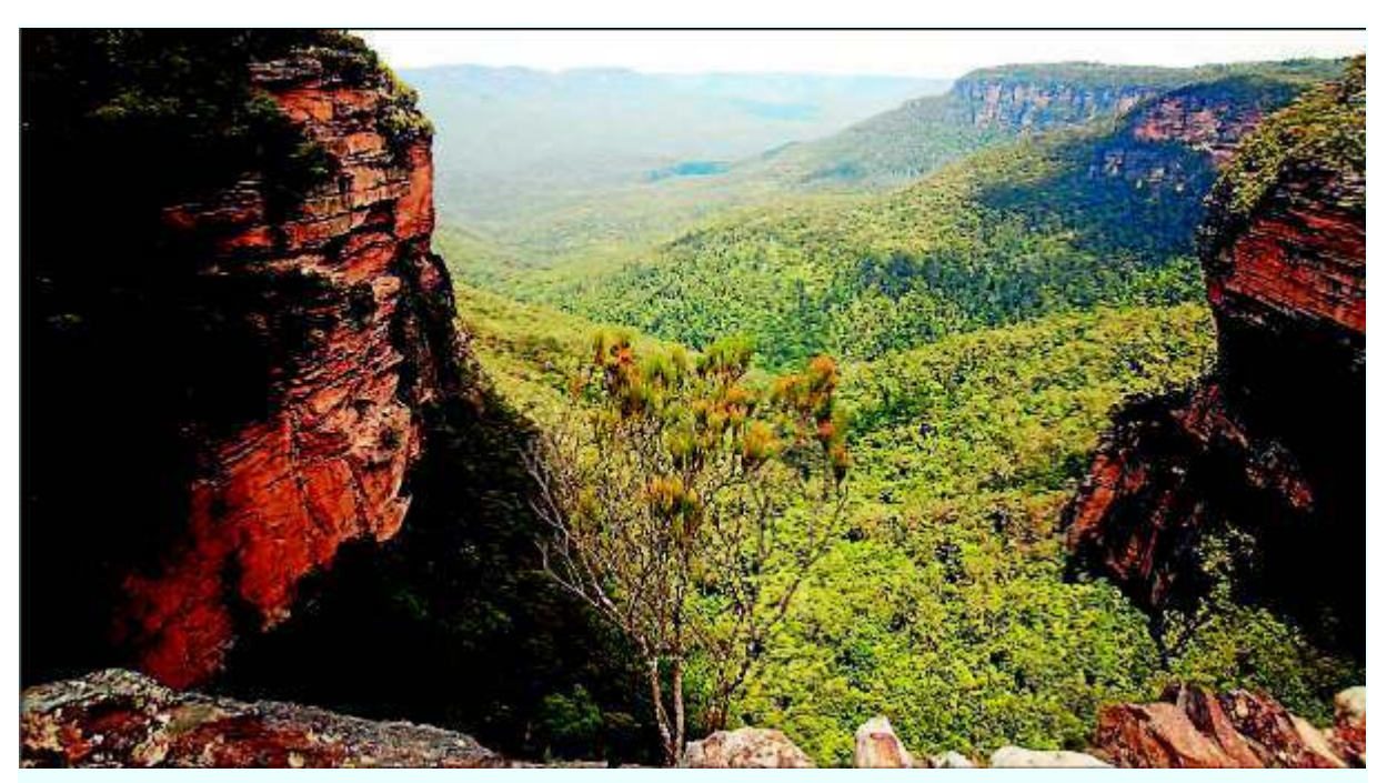
\label{location} \mbox{Location with character} \dots \mbox{``people grow from places: places make them''}.