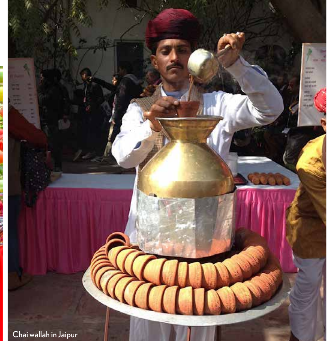
Chai wallah in Jaipur