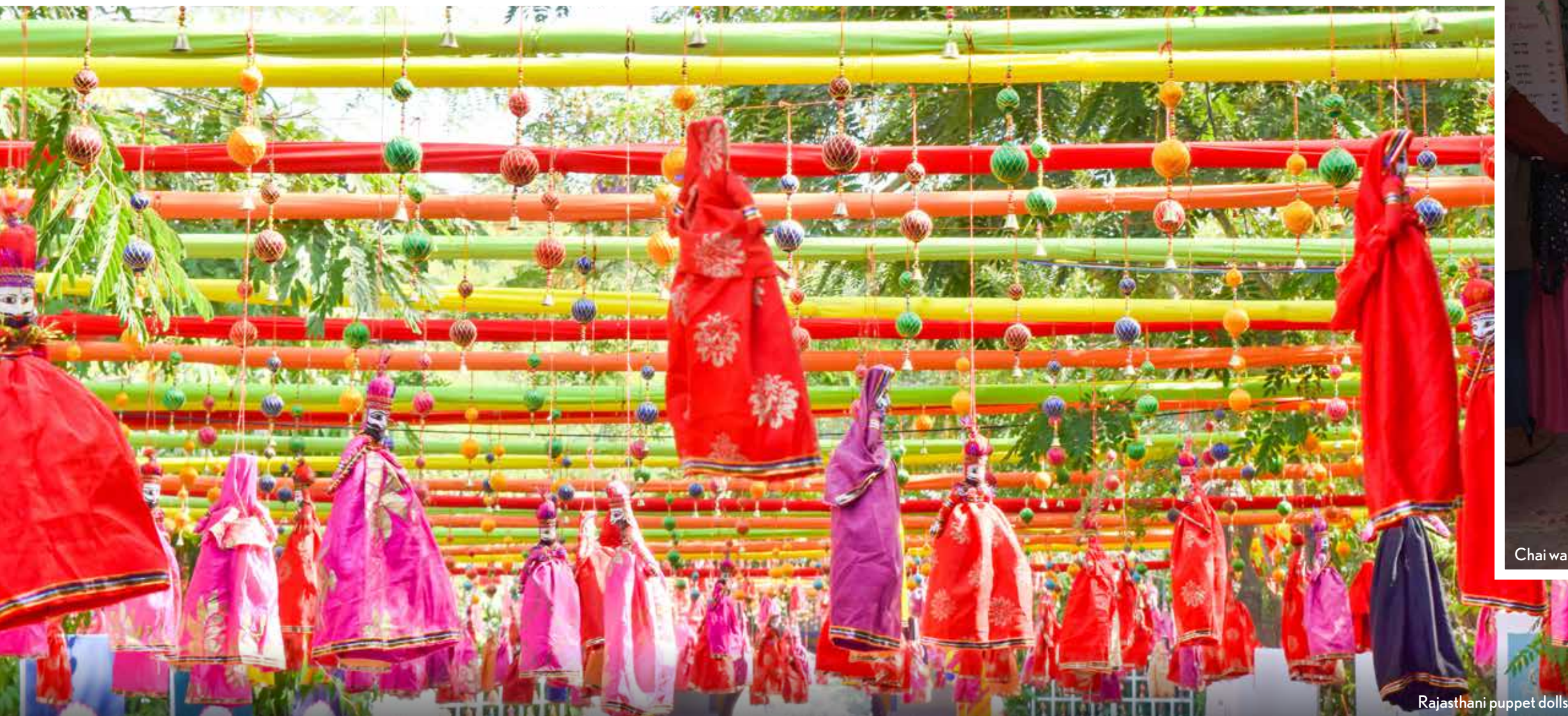
Rajasthani puppet dolls