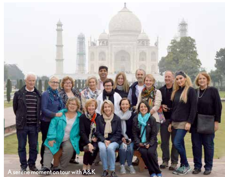
A serene moment on tour with A&K

It's another fairytale arrival at the Oberoi Udaivilas where rose petals rain down as we enter the marbled foyer. More recently, Udaipur has become famous as one of the locations where The Best Exotic Marigold Hotel was shot, and we brush with fame in one textile shop where, like us, Judi Dench bought pashmina scarves. But it's the miniature paintings inside the City Palace, the sunset cruise on the lake and an invitation to take tea with Sunny's family at home, that are most memorable.