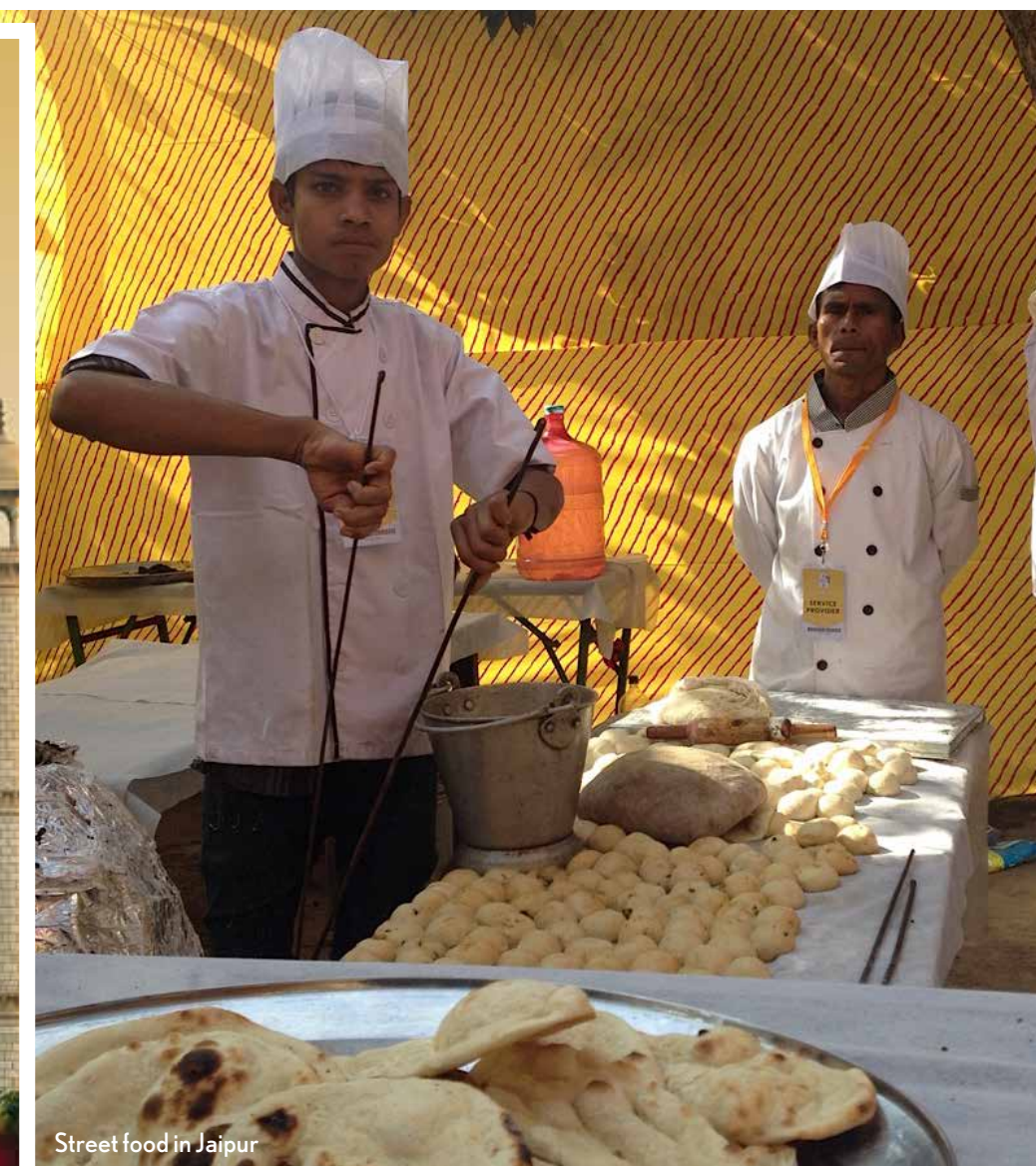
Street food in Jaipur