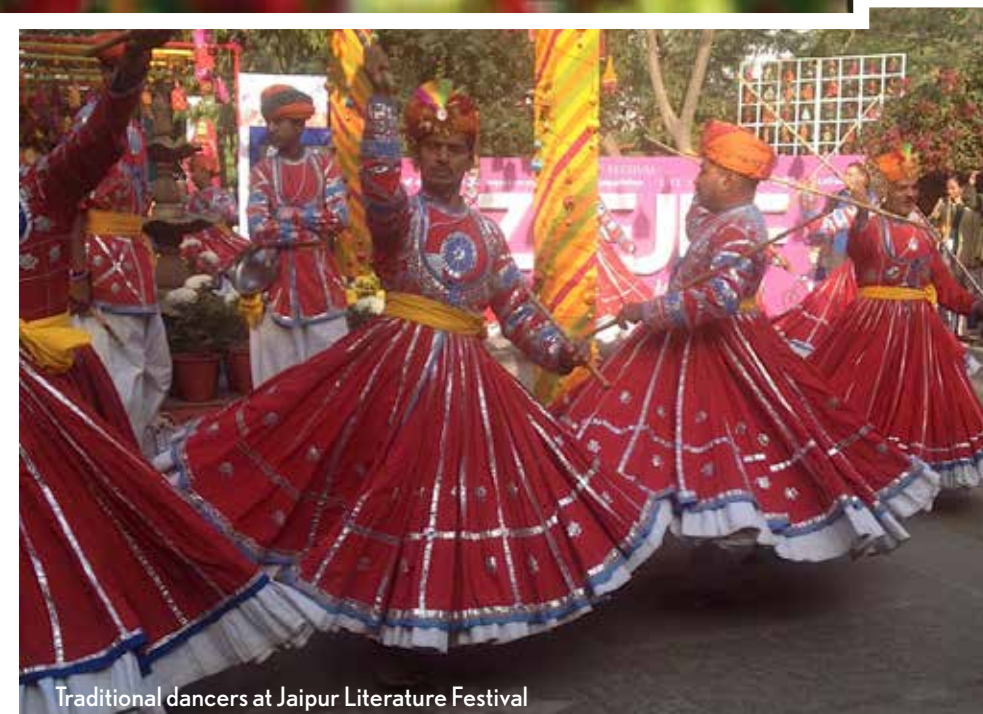
Traditional dancers at Jaipur Literature Festival

prisoner by the British, an Indian school group arrives filling the serene gardens with youthful chatter. It's a perfect reminder of the parallel currents in India - the modern alongside the mystical. From there it's a walk through Lodi Gardens, where Khushwant Singh, one of the city's most well-known authors, enjoyed early evening walks before a peg of whisky, and then to meet Rana Dasgupta, whose biography of the city, Capital , has the group of Australians riveted. In an art deco apartment, Dasgupta describes the complexities of this ancient and cultured city. "This is not a naive society," he says. "It has enormous political and philosophical debates around issues. India is changing at a fast, furious pace."